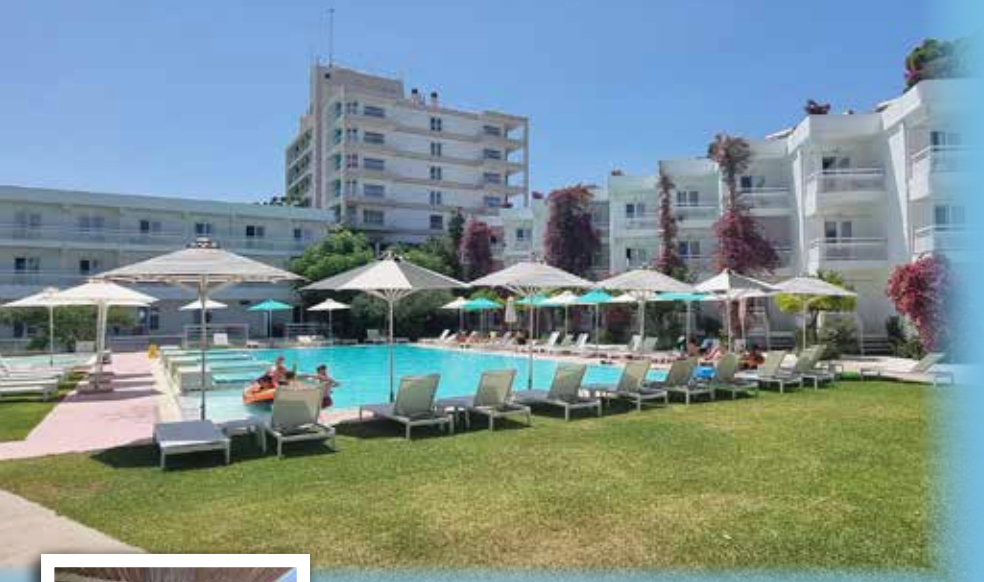
Hotel Marathon Beach