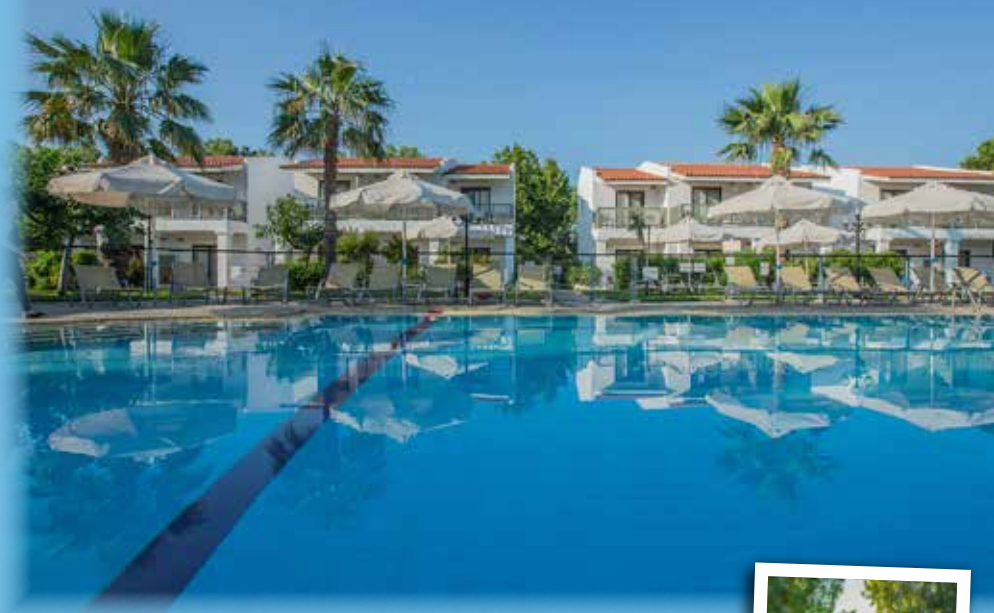
Resort Golden Coast